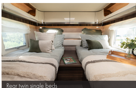
Rear twin single beds