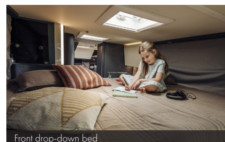
Front drop-down bed