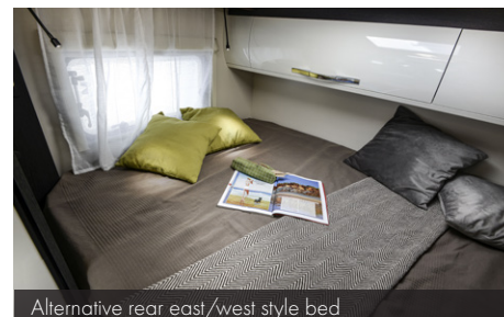
Alternative rear east/west style bed